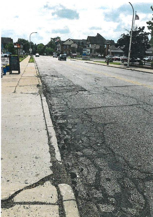
Facing Southwest from Railroad Crossing