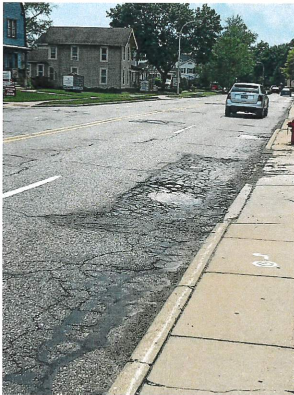
Facing Southwest from Union Street