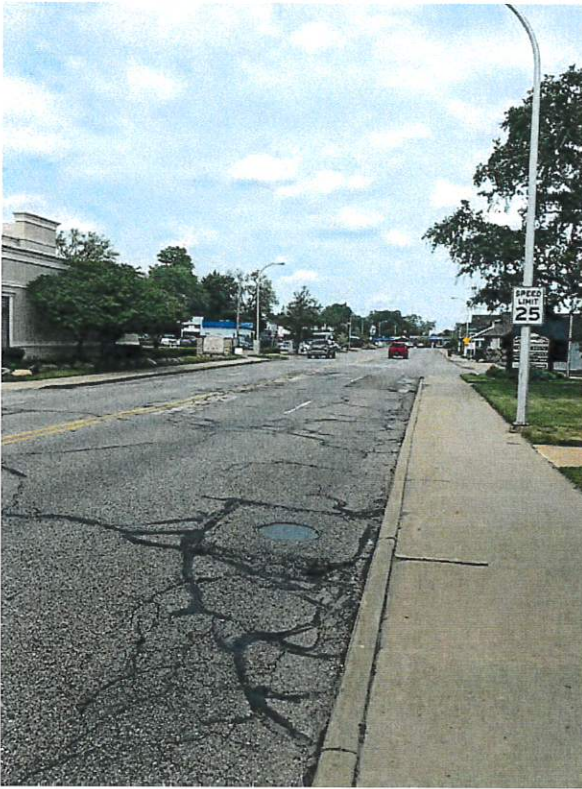
Facing Northeast at the Plymouth Banquet Center