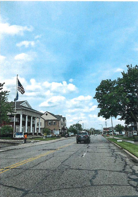
Facing Northeast at the Plymouth Arts and Recreation Center